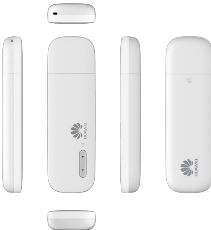
Figure 1-1 E8231 profile