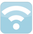
Figure 1-1 shows multi-devices access the wireless work through Wi-Fi and USB.