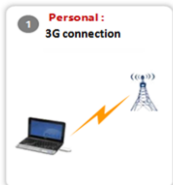
Figure 1-1 shows the device connecting to the network by USB.

After you connect the E8231 to a PC with the USB interface, you can send or receive E-mail, access the network through wireless connection, and download files through wireless data channels.