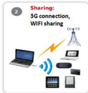
Figure 1-1 shows multi-devices access the wireless work through adapter

Figure 1-1 shows multi-devices access the wireless work through Wi-Fi and USB.