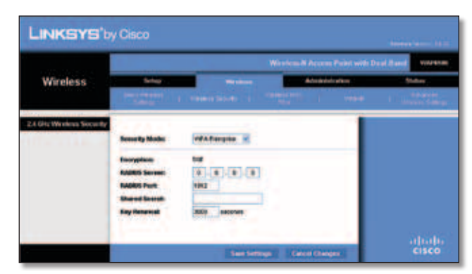
Security Mode > WPA Enterprise

This option features WPA used in coordination with a RADIUS server. (This should only be used when a RADIUS server is connected to the Access Point.)