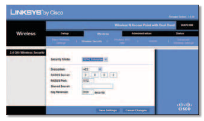
Security Mode > WPA2 Enterprise

This option features WPA2 used in coordination with a RADIUS server. (This should only be used when a RADIUS server is connected to the Access Point.)