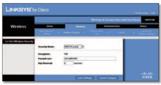
Security Mode > WPA Personal

WPA is a security standard stronger than WEP encryption.