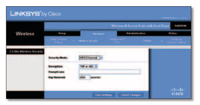
Security Mode > WPA2 Personal

WPA2 is a more advanced, more secure version of WPA.