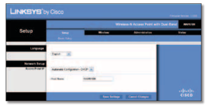
Setup > Basic Setup (Automatic Configuration - DHCP)

The first screen that appears is the Basic Setup screen. Use this screen to change the browser-based utility's language, or to change the Access Point's wired, Ethernet network settings.