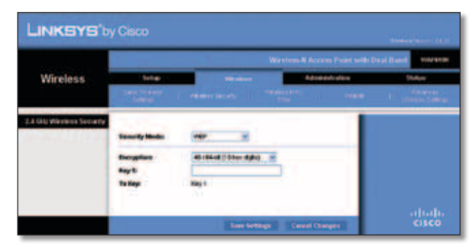
Security Mode > WEP

WEP is a basic encryption method, which is not as secure as WPA or WPA2.