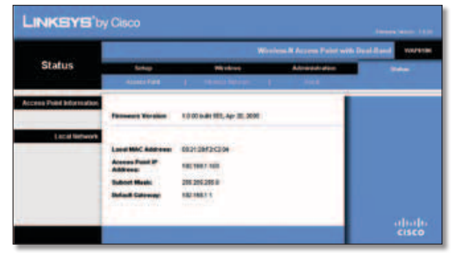
Status > Access Point

The Access Point's current status information is displayed.