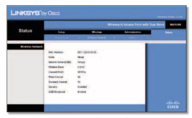
Status > Wireless Network

Information about your wireless network is displayed.