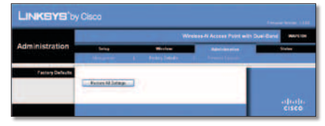
Administration > Factory Defaults

Restore All Settings To reset the Access Point's settings to the factory defaults, click Restore All Settings . Any settings you have saved will be lost when the default settings are restored.