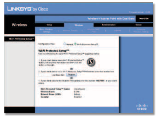
Wireless > Basic Wireless Settings (Wi-Fi Protected Setup)

Wi-Fi Protected Setup™ is a feature that makes it easy to set up your wireless network. If you have client devices, such as wireless adapters, that support Wi-Fi Protected Setup, then you can use Wi-Fi Protected Setup to configure wireless security for your wireless network. Otherwise, use manual setup (refer to "Basic Wireless Settings (Manual)" on page 4).