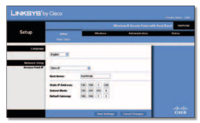
Setup > Basic Setup (Static IP)