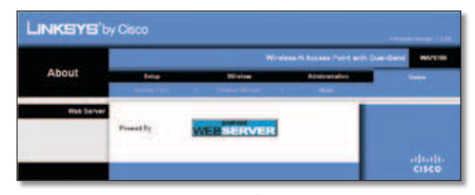
Status > About

Information about the browser-based utility is displayed.