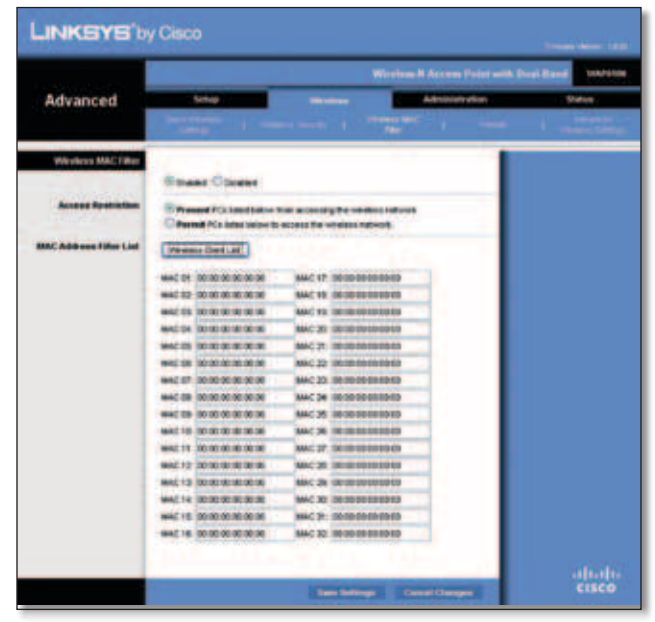
Wireless > Wireless MAC Filter

Wireless access can be filtered by specifying the MAC addresses of wireless devices within range of your network.