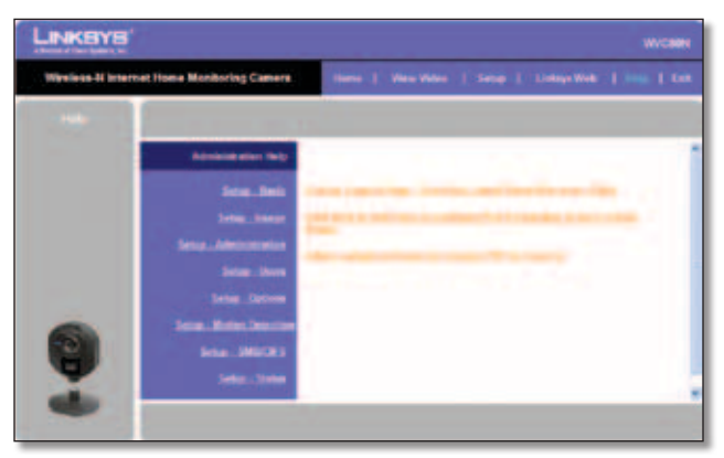
Setup > Help

Through the Help screen, you'll find links to additional resources for the Camera and its Utility. If you select the Help tab directly from the Welcome screen, then you will see the User Help screen and will only be able to access these resources. If you first log in to access the Camera's Setup and then select the Help tab, you will see the Administrator Help screen and will be able to restore factory defaults and upgrade the Camera's firmware.