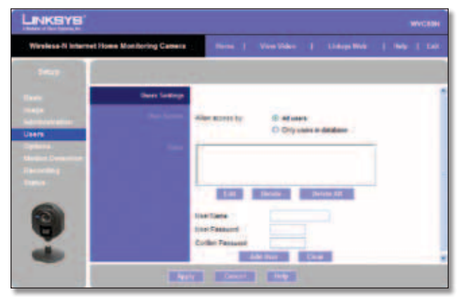
Setup > Users

The Setup > Users screen lets you designate access rights for the Camera's users.