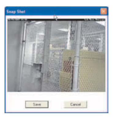
Snap Shot Window

When you click this button, the Snap Shot window appears. Click Save to save the image, or click Cancel to exit without saving the image.