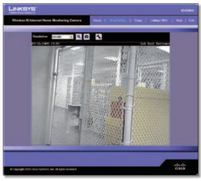
View Video (640x480 Resolution)

The top of the View Video screen contains a number of controls that are used to adjust the video display. These controls and their functions are described in the sections below.