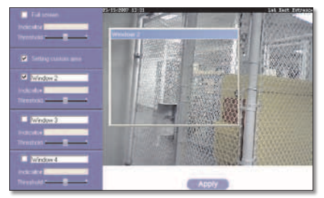
Set Sensitivity Area

Set Sensitivity Area If you want to specify the sensitivity area settings for motion detection, click this button to display the Set Sensitivity Area window. The Set Sensitivity Area window lets you specify the area of the video screen that is used to detect motion. This is either the full screen, or up to three user-defined custom areas within the full screen.