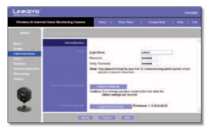
Setup > Administration

The Setup > Administration screen allows you to change the Camera's login name and password, reset the factory defaults, upgrade the firmware, and set the language.