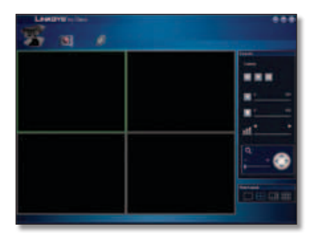
Viewing Area - Four-Camera Display