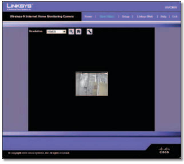
View Video (160x120 Resolution)