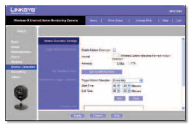
Setup > Motion Detection

The Setup > Motion Detection screen allows you to configure the Camera's motion detection settings.