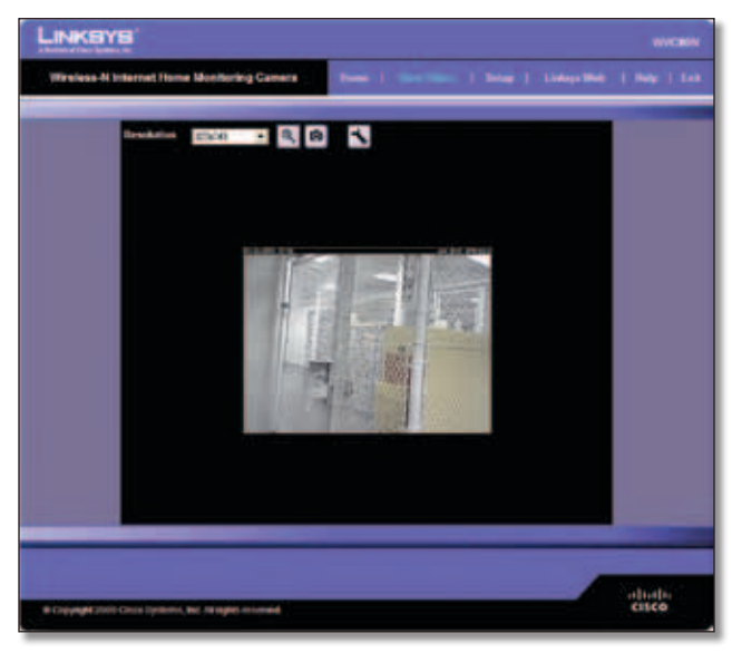
View Video (320x240 Resolution)

Use the Resolution drop-down menu to select the display resolution. Possible values are Auto (default), 640x480 , 320x240 , or 160x120 . The display changes to the new resolution immediately after it is selected.