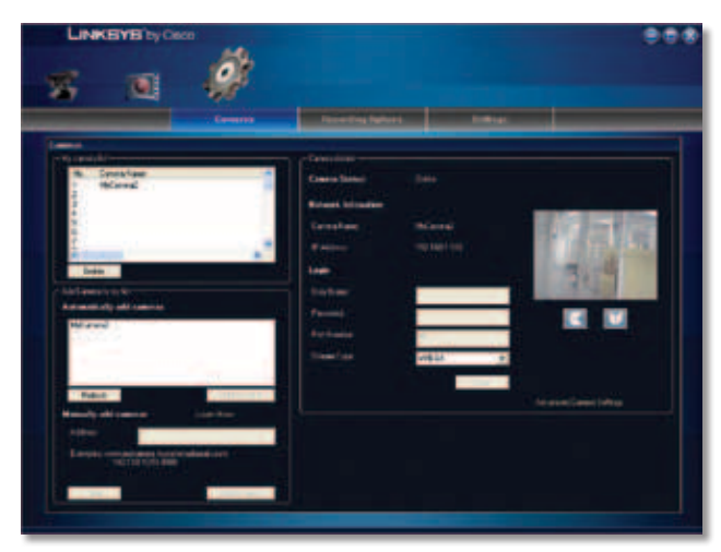
Setup > Cameras

Click the Cameras tab to set up a network Camera.