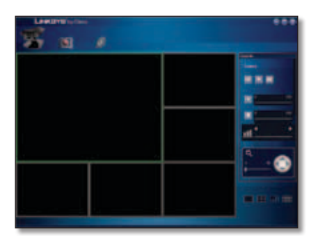
Viewing Area - Six-Camera Display