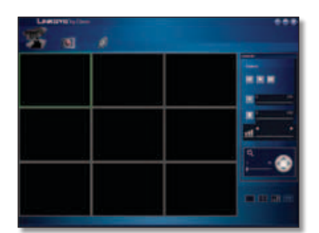
Viewing Area - Nine-Camera Display