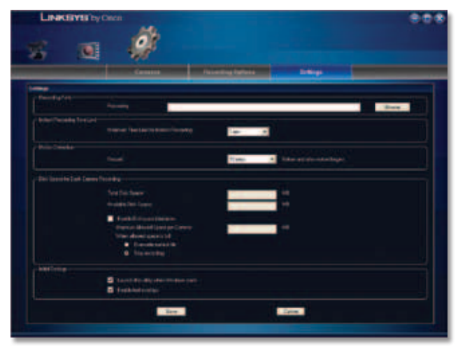
Setup > Settings

Click the Settings tab to configure the Camera Utility's settings.