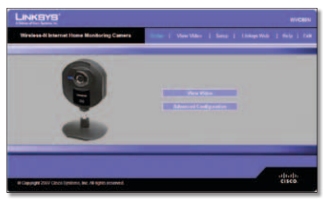
Web-Based Utility Welcome

The Welcome screen of the Web-based Utility will appear.