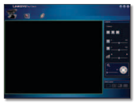
Viewing Area - Single-Camera Display

The viewing area takes up most of the LiveView window. The viewing area can have four different layouts, with video windows for one, four, six, or nine Cameras. The layout is selected using the video layout controls described in "Video Layout" below.