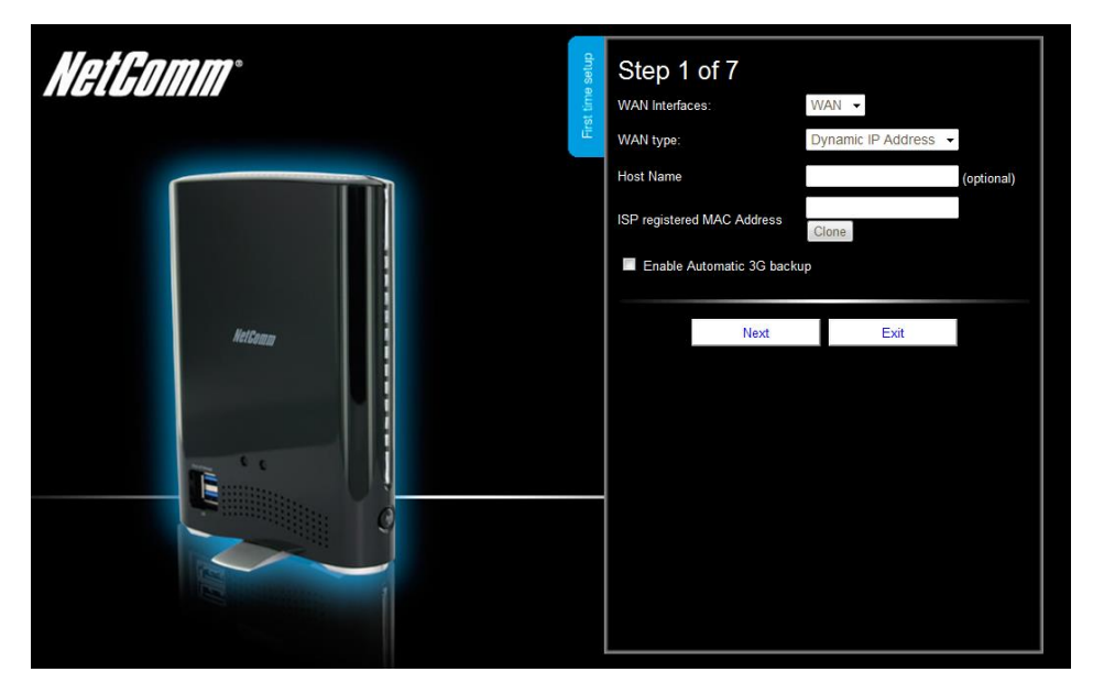
Figure 2: Setup Wizard Step 1 – WAN Interface

Select your WAN interface preference – Ethernet WAN, 3G or Ethernet WAN with 3G backup. The example above shows an Ethernet WAN connection with 3G backup. Press the Next button to continue the setup wizard.