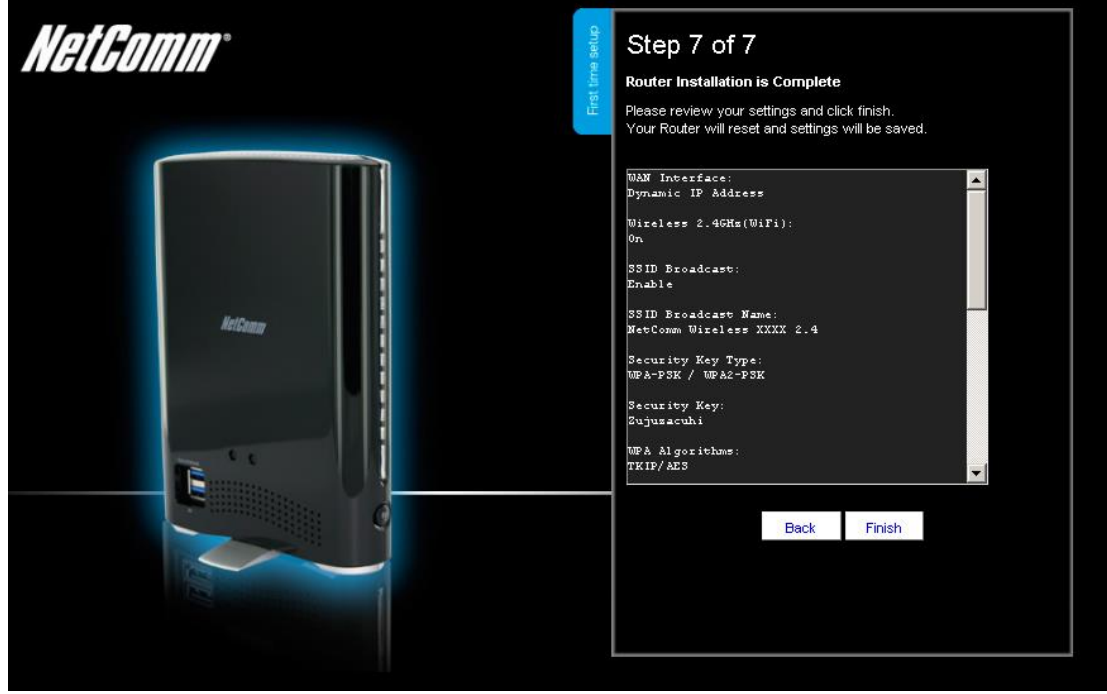
Figure 7: Setup Wizard Step 7 - Summary

In Step 6 of the NF2 Setup Wizard the administration password for the router can be set to prevent unauthorised access to the router management page. Enter the Desired Username and Desired Password, retyping the desired Password in the Retype Password field to confirm the new password. Click Next to continue the setup wizard.