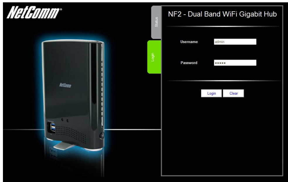
Figure 8: Management Console Login

Please note: In the event that your Internet connection becomes unavailable and no fail over service has been configured, the NetComm NF2 Management console page will display when attempting to browse to an Internet site.