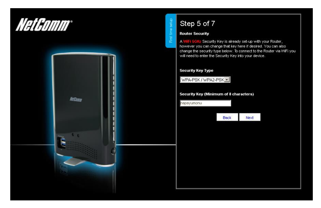
Figure 5: Setup Wizard Step 5 - 5.0 GHz Wireless Security Setup

This page allows you to configure the 5.0 GHz WiFi security settings for the NF2. Setting a strong wireless security level (such as WPA-PSK - AES) can prevent unauthorized access to your wireless network. Please enter the Security Key that you wish to use, or leave this field unchanged to use the default Security Key. Click "Next" to continue.