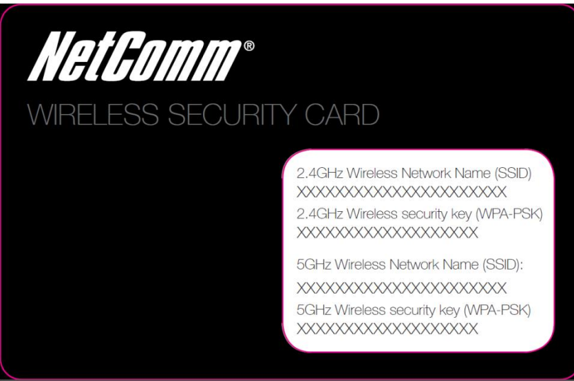
Figure 1: Included Security Card