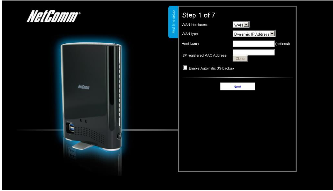
Figure 66: Advanced - Toolbox - Startup Wizard

The Startup Wizard option will return the user to the NF2 Startup wizard so that the router can be reconfigured.