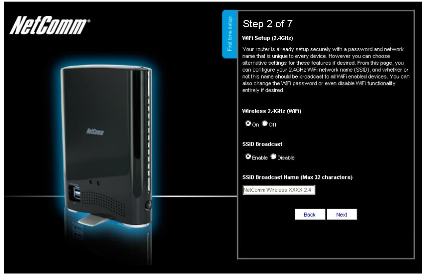
Figure 3: Setup Wizard Step 2 - 2.4 GHz WiFi Setup

This page allows you to customize the 2.4GHz wireless setting of the NF2.