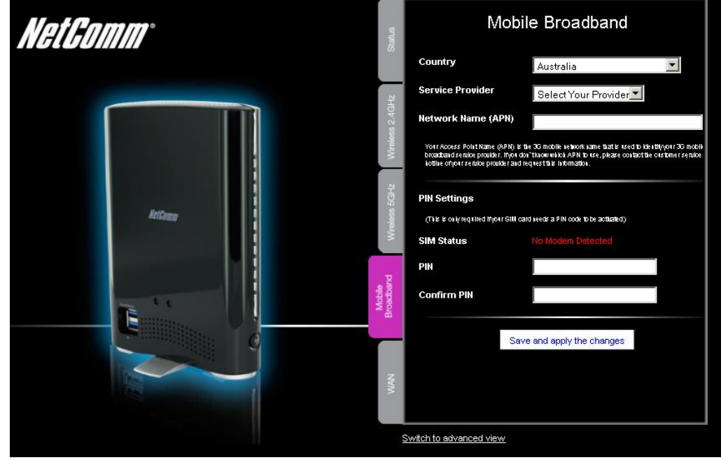
Figure 11: Basic View - Mobile Broadband

This page allows you to configure the MBB (Mobile Broadband) WAN connection settings for the NF2.