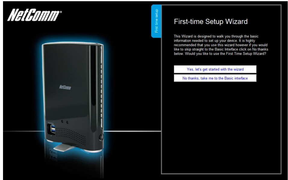
Figure 2: Setup Wizard - Start

When you log in to your NF2 for the first time, you will be presented with the NF2 "Set-up Wizard" as shown in the screenshot below. This wizard can be skipped by clicking on the link shown on the screenshot below. You can re-run the Setup Wizard again anytime after first use by selecting the "Setup Wizard" option under the "Toolbox" tab in the Advanced View of the management console.