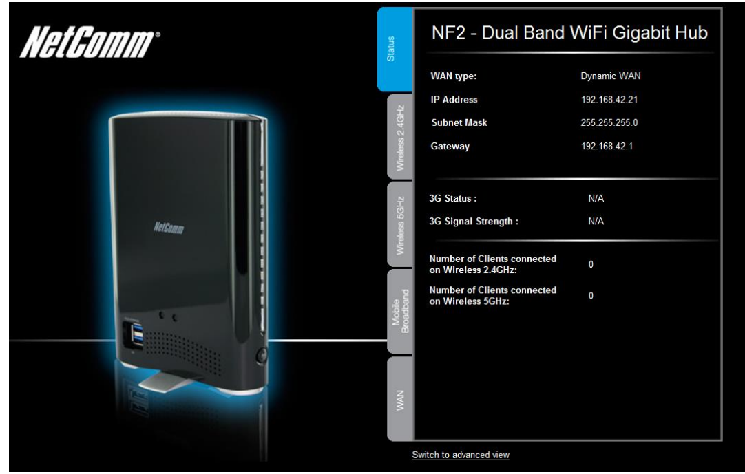
Figure 9: Basic View – Status

The basic status page provides basic system related information. It can be accessed by clicking on the "Switch to Basic view" button from the top of the status page.