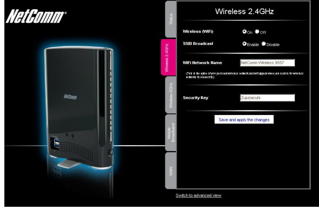
Figure 11: Basic View – 2.4 GHz Wireless

This page allows you to configure basic 2.4 GHz WiFi settings for this device such as enabling/disabling the 2.4 GHz WiFi functionality, changing the 2.4 GHz Wireless Network Name (SSID) or the 2.4 GHz Wireless Security key. If you make any changes to the settings, click the "Save and apply changes" button to make these changes active.