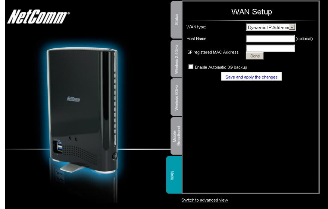
Figure 12: Basic View – WAN

This page gives the user the option of selecting the WAN interface type. Options include Dynamic IP address (the default option), Static IP Address, PPPoE, PPTP, or L2TP. There is also an option to enter a Host Name with which to access the router instead of having to enter an IP address into a browser, which may be difficult to remember. You can also press the clone button to automatically detect the WAN connection's MAC address.