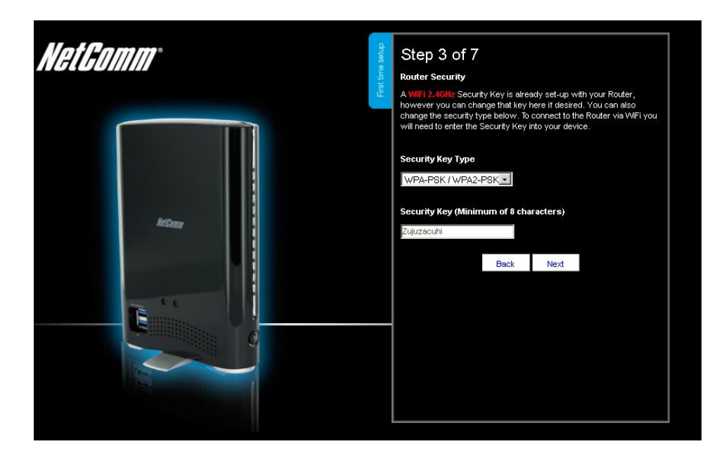
Figure 4 - Setup Wizard Step 3 – 2.4 GHz WiFi Security Settings

This page allows you to configure the 2.4 GHz WiFi security settings for the NF2. Setting a strong wireless security level (such as WPA-PSK - AES) can prevent unauthorized access to your wireless network. Please enter the Security Key that you wish to use, or leave this field unchanged to use the default Security Key. Click "Next" to continue.