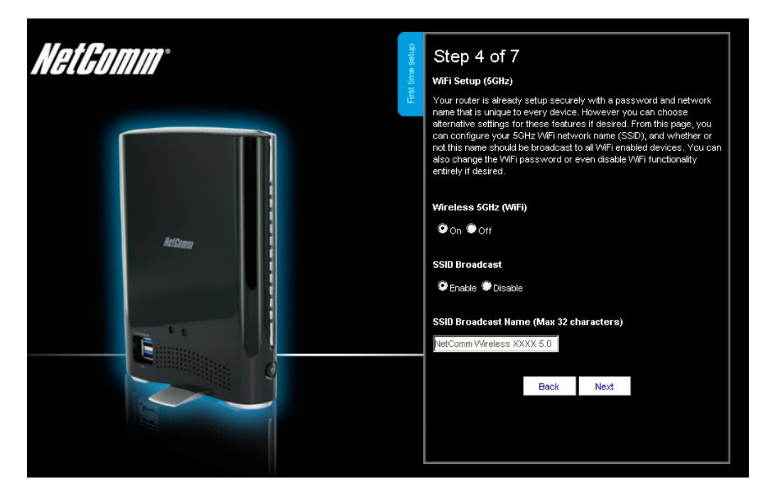
Figure 7: Setup Wizard Step 4 - 5.0 GHz WiFi Setup

This page allows you to configure the 2.4 GHz WiFi security settings for the NF2. Setting a strong wireless security level (such as WPA-PSK - AES) can prevent unauthorized access to your wireless network. Please enter the Security Key that you wish to use, or leave this field unchanged to use the default Security Key. Click "Next" to continue.