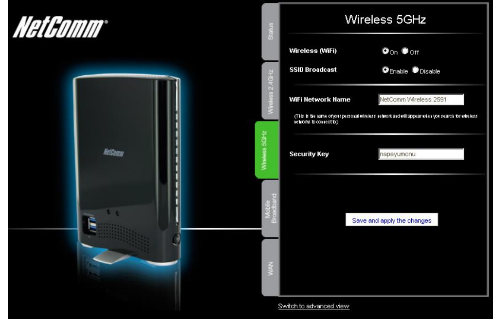
Figure 10: Basic - 5.0 GHz Wireless

This page allows you to configure basic 5.0 GHz WiFi settings for this device such as enabling/disabling the 5.0 GHz WiFi functionality, changing the 5.0 GHz Wireless Network Name (SSID) or the 5.0 GHz Wireless Security key. If you make any changes to the settings, click the "Save and apply changes" button to make these changes active.